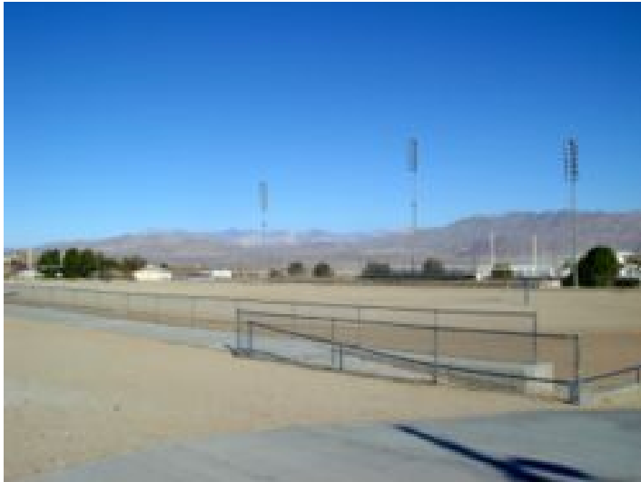
Trona High School Football Field