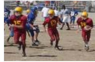
Trona’s sand field... “The Pit”